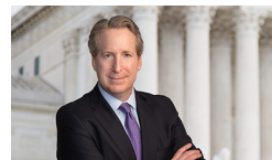
ジョン E. ケリー