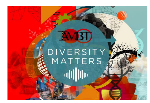
Latest Episode of Diversity Matters