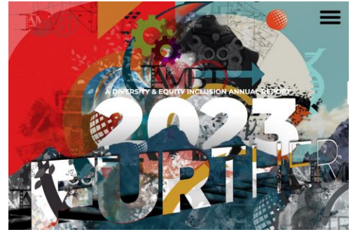
View Our 2023 Diversity, Equity and Inclusion Annual Report