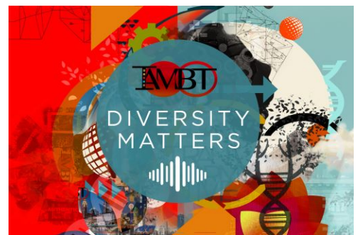
Latest Episode of Diversity Matters